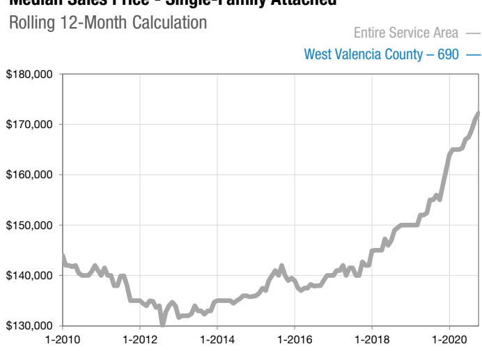
A rolling 12-month calculation represents the current month and the 11 months prior in a single data point. If no activity occurred during a month, the line extends to the next available data point.