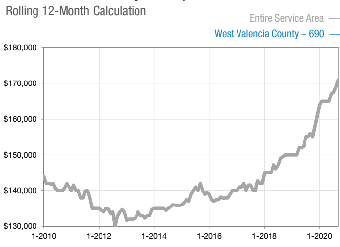
A rolling 12-month calculation represents the current month and the 11 months prior in a single data point. If no activity occurred during a month, the line extends to the next available data point.