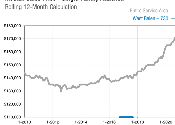
A rolling 12-month calculation represents the current month and the 11 months prior in a single data point. If no activity occurred during a month, the line extends to the next available data point.