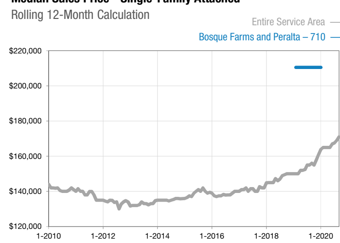
A rolling 12-month calculation represents the current month and the 11 months prior in a single data point. If no activity occurred during a month, the line extends to the next available data point.